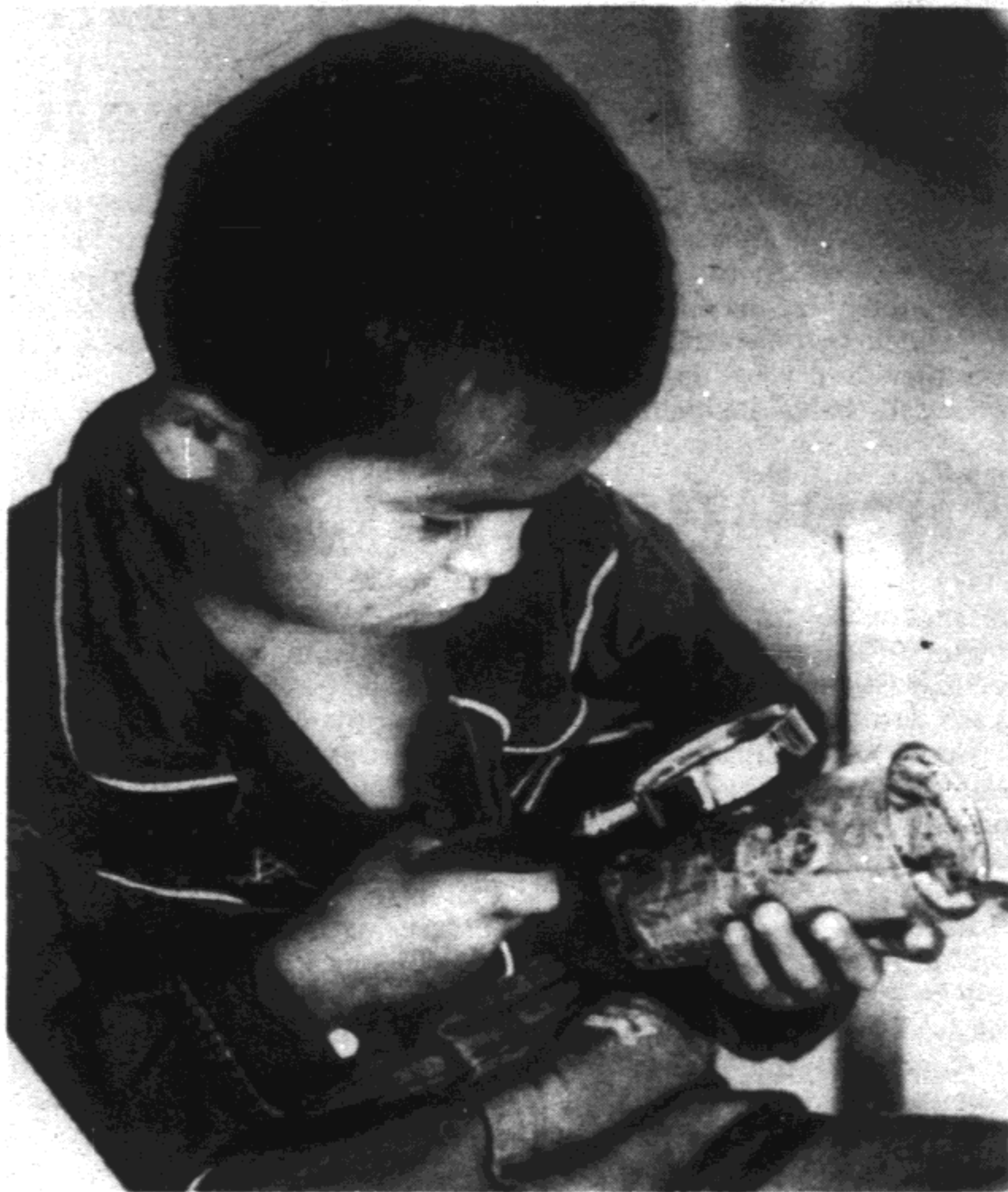
THE GROWTH OF A SEED into a complicated plant with roots, stem and leaves is fascinating. Seeing this growth process through a magnifying glass adds even more fun for the Head Start youngsters in rural Alaska.

This program has provided heavy equipment such as caterpillars and large trucks to villages in rural Alaska for village projects. Transportation of this equipment has been a major problem in the past and the tan-