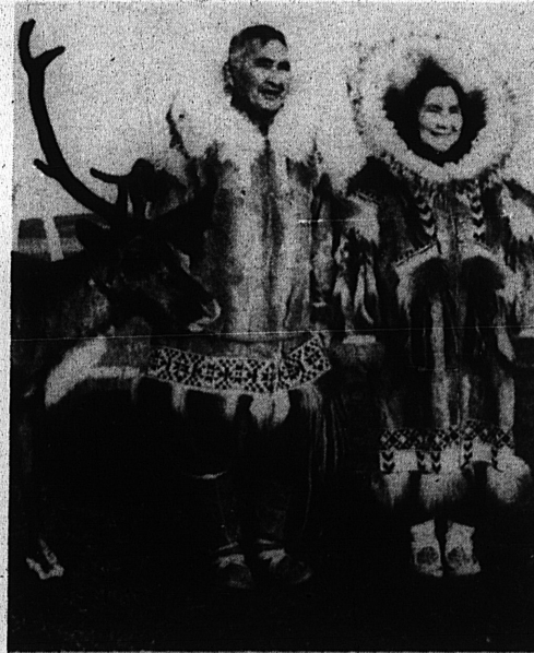
A PRIME ITEM FOR GIVING ANYTIME

"Be happy. I know this way how I be "Longest Reindeer Herder." Start 1908, finish 1954, altogether 46 years herd reindeer."