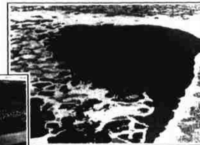
Regulations would allow hunting by both Native and non-Native residents of rural Alaskan areas where spring hunting of waterfowl and other migratory birds is an important part of the subsistence economy.

Migratory birds taken in a nonwasteful manner for nutritional needs could be used for personal and family consumption and could be shared with others in the immediate community that are in need of food. The birds or parts of birds could not be sold.