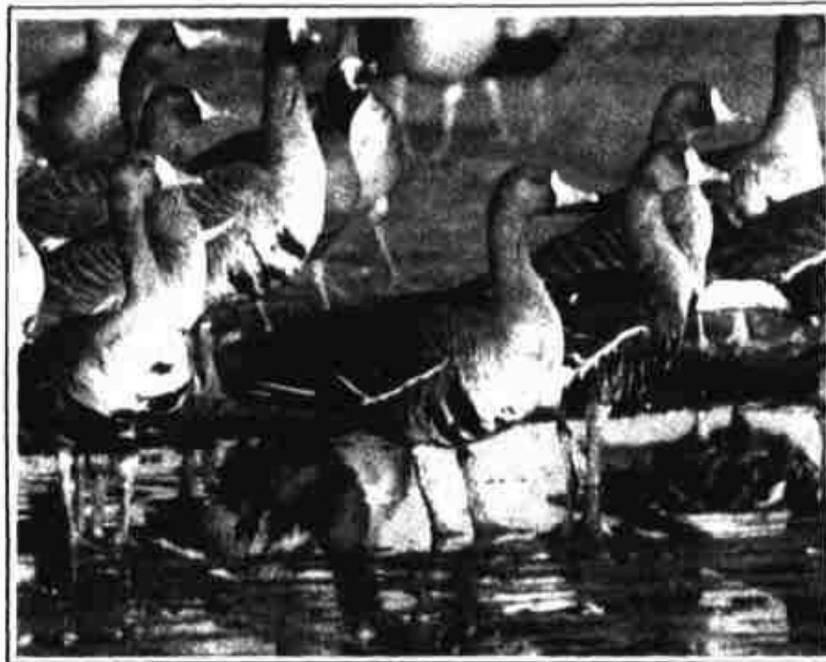
The new federal regulations would address migratory bird hunting in Alaska during spring and summer, specifically hunting which occurs between March 10 and September 1.

Seasons, bag limits, species restrictions, harvest quotas, management units, and methods and means of taking are other ways commonly used to regulate harvest of migratory birds and could be used if and when needed to regulate subsistence hunting. All of these are used in one way or another to regulate hunting of migratory birds in fall and winter hunting seasons in Alaska and the lower 48 states. For example, all of these states have bag limits that restrict the number of birds that hunters can take in a day of