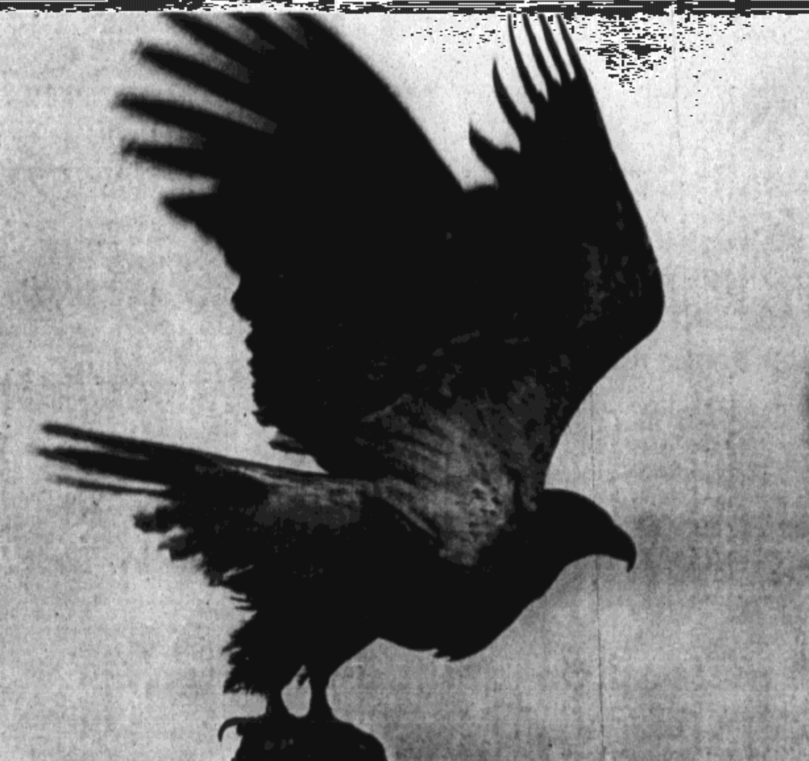
AN EAGLE takes flight from the Sand Point cannery dock.