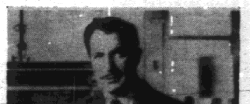
Introduction by Vincent Price