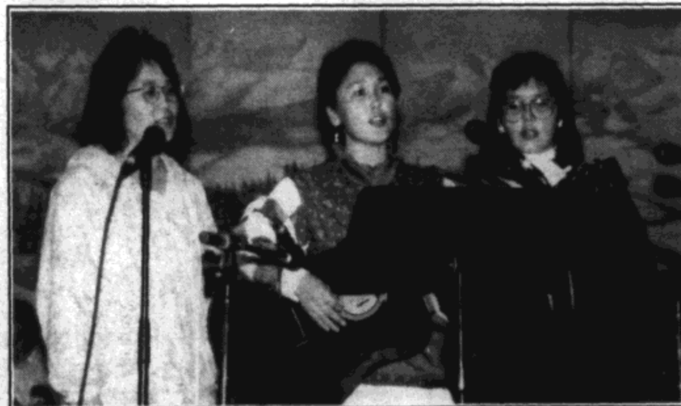
The Togiak Sisters Trio was a highlight during the Anchorage Fur Rendezvous celebration last month.