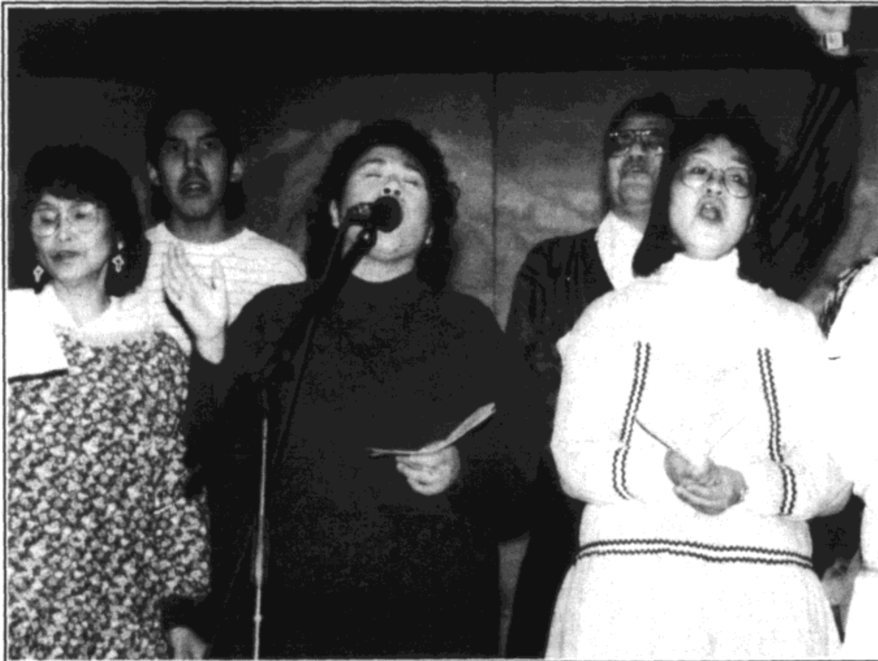
Anchorage Native Choir members sing heartfelt hymns. Many of the members are local to Anchorage, but take anybody from anywhere to join in their singspiration.