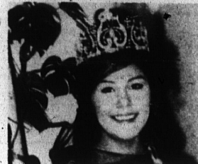
MISS MT. EDGECUMBE