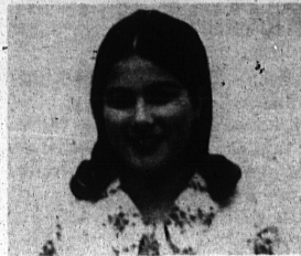
MISS A.N.B., NOME

FAIRBANKS—Nine pretty girls have signed up to compete for the title of Miss Eskimo Olympics and the contest will remain open to entry until just before the Olympics begin Friday.