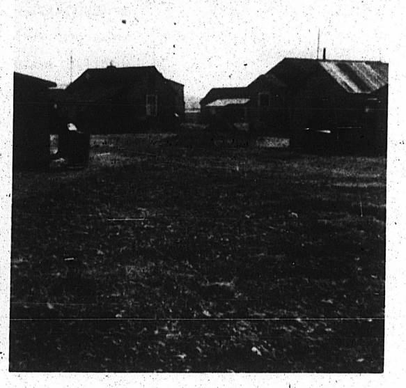
Landscape after backfilling in Nikolski