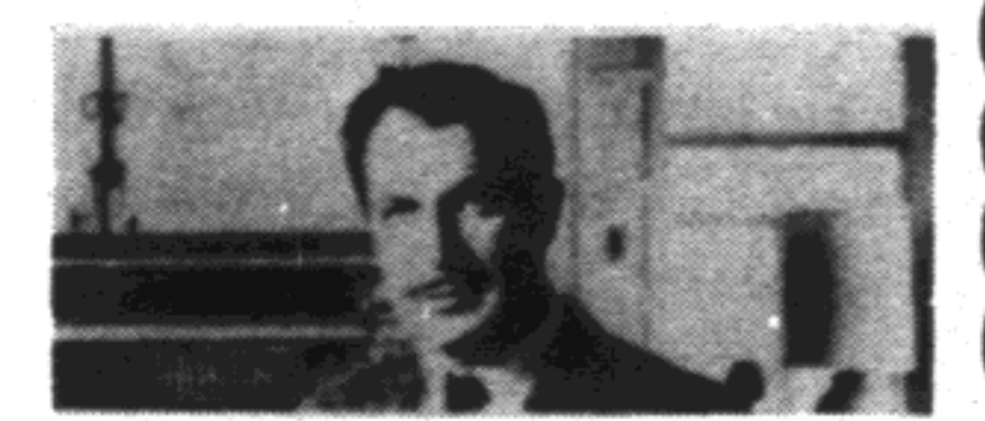
Introduction by Vincent Price