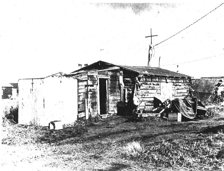
THE OLD — Houses like this were the only shelters the Eskimos had at Unalakleet before the federal government provided materials for new homes.