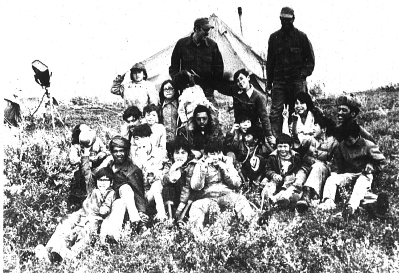
ALL IN THE FAMILY — Some of Unalakleet's children gather in front of E Company's supply tent for a farewell picture.

'Everything I Ate Was Eskimo Style - I Never Had Anything Like That Before' One Soldier Remarkd