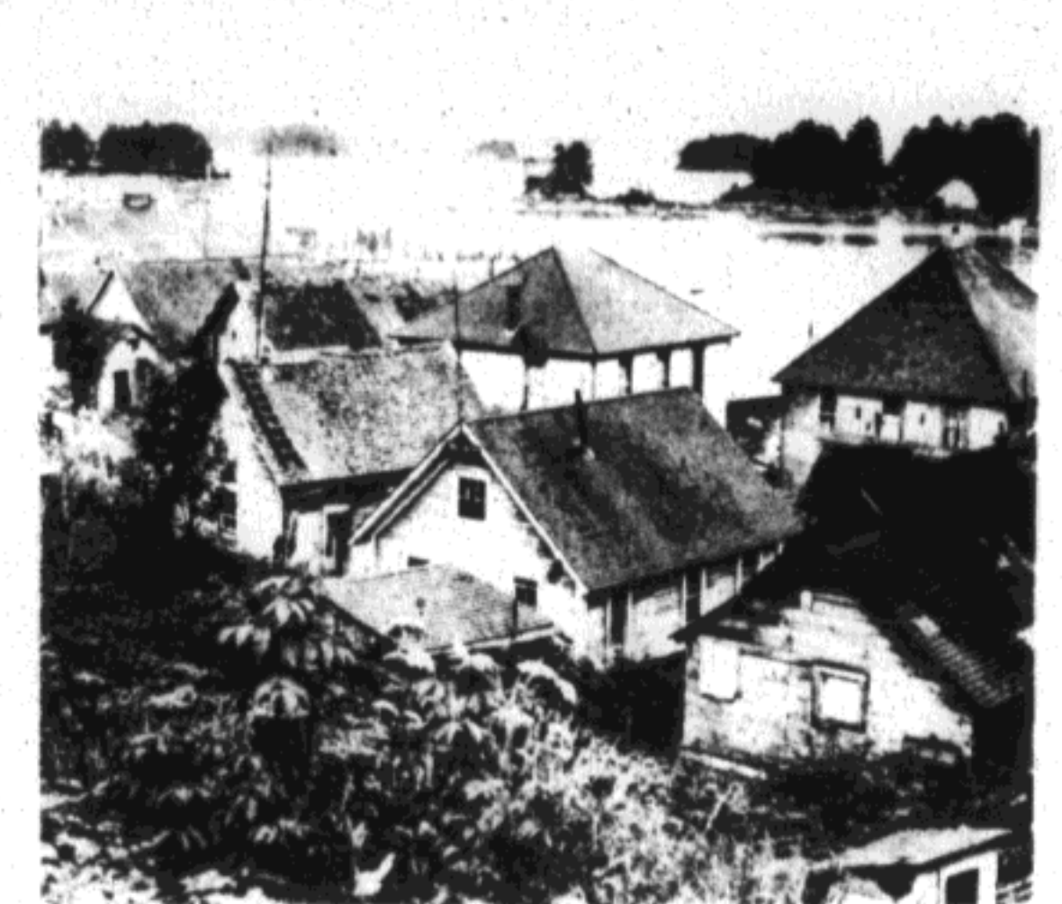
U. S. Department of the Interior

The experience of the Tlingit and Haida Indians with the courts made Native leaders reluctant to look to judicial settlement of land rights questions. In 1935, The Congress had enacted legislation which permitted the two southeastern groups to sue the federal government in the Court of Claims for land taken by the United States, most of it for the Tongass National Forest, which they historically used and