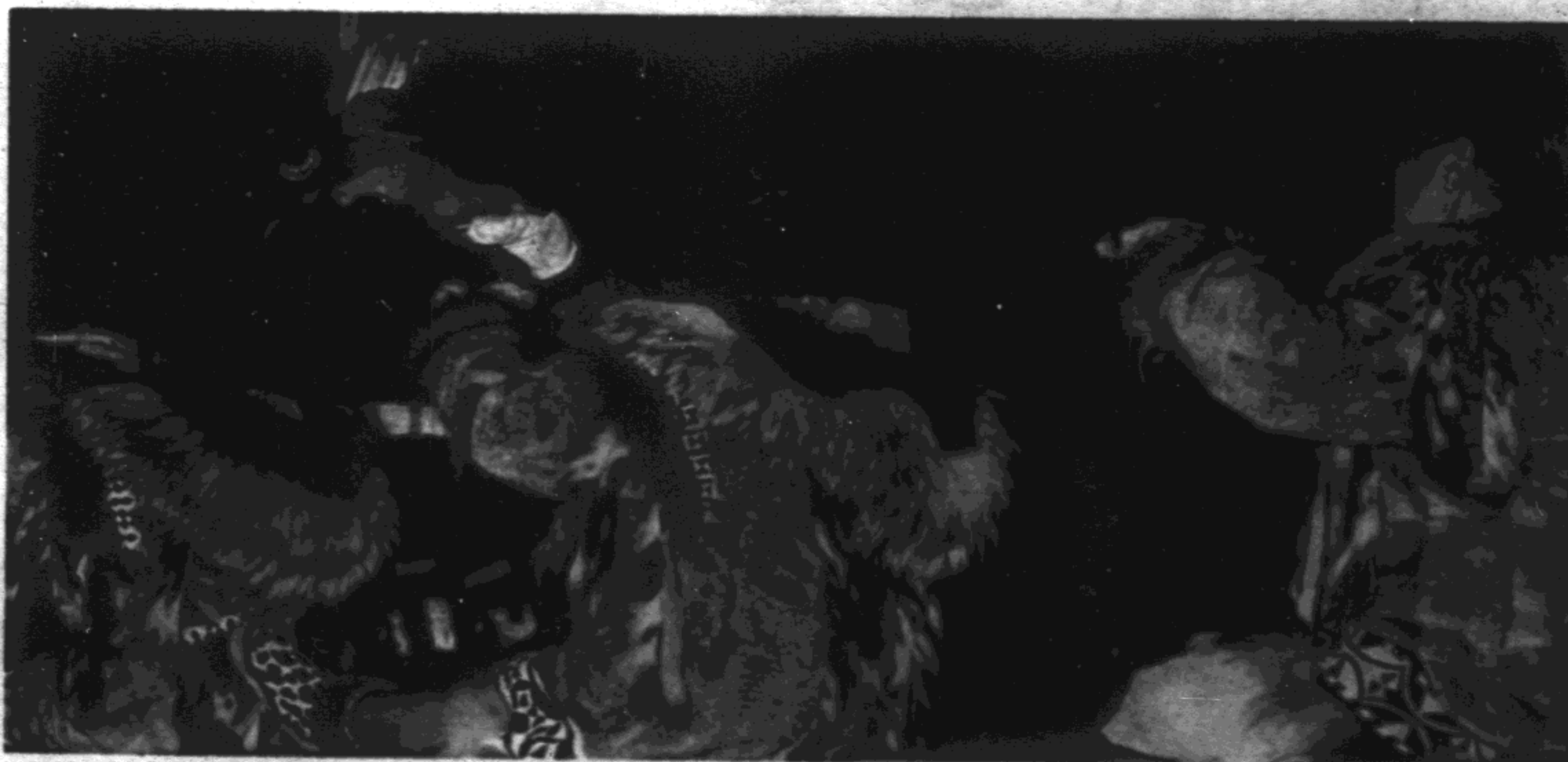
SITTING ACCOMPANYMENT —Dressed in their beautiful and traditional parkas, Barrow women are accompanying the male dancer in a rhythmic and dramatic dance during the World Eskimo

Olympics recently. The Barrow dance group won the title going away. The groups are judged by the authenticity of the dance, grace, and authentic costumes.