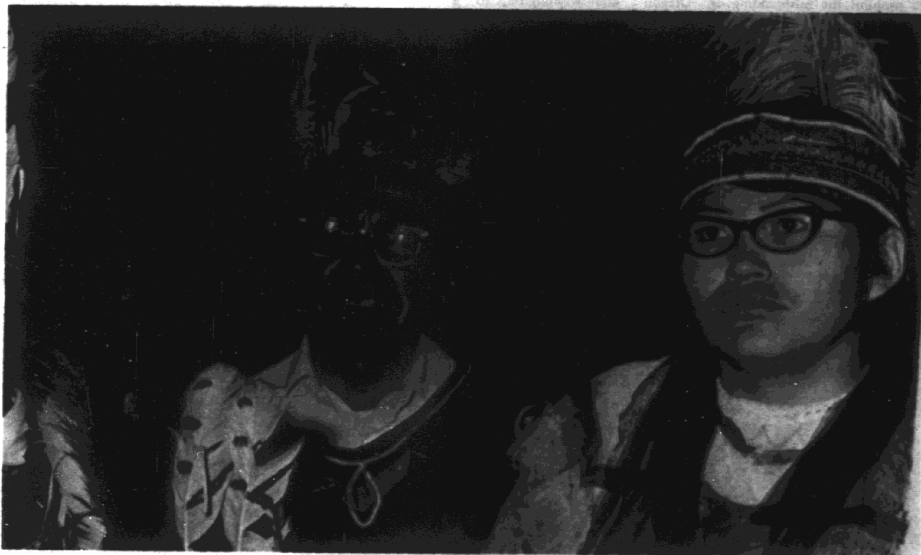
INTERESTING FACES —Minto dancers are relaxing after putting on a colorful Athabascan Indian dance at the recent World Eskimo Olympics. The Minto group was the automatic winner in the Indian dance entry as no other Indian group participated. The

people of Minto have in recent years made strong efforts to revive their traditions and they are having an interesting and happy time doing it.