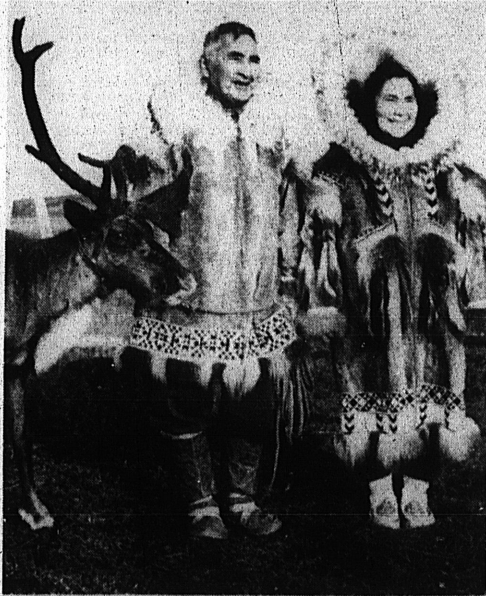
A PRIME ITEM FOR GIVING ANYTIME

"Be happy. I know this way how I be "Longest Reindeer Herder." Start 1908, finish 1954, altogether 46 years herd reindeer."