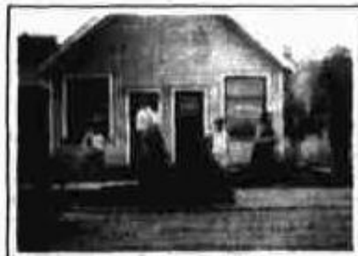
The first construction project in Cordova during 1934