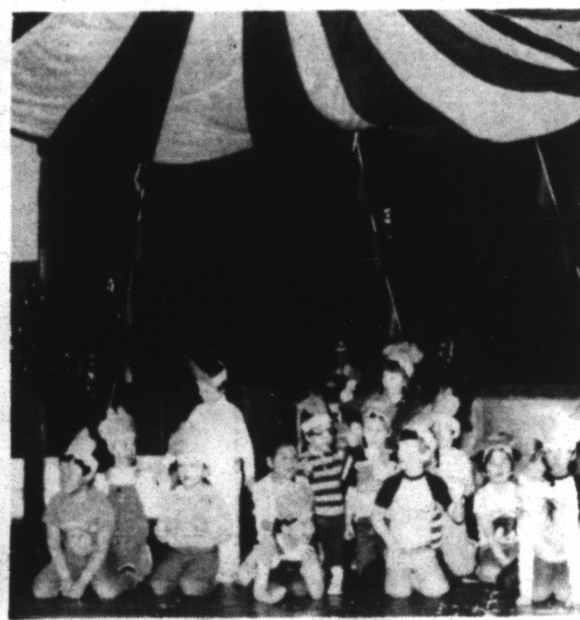
Leaping frogs pose for pictures