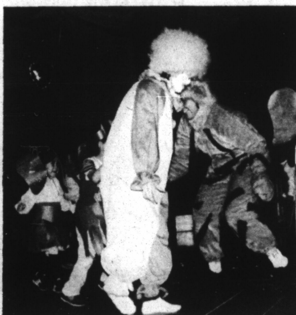
Elephants, clowns and tigers frolic