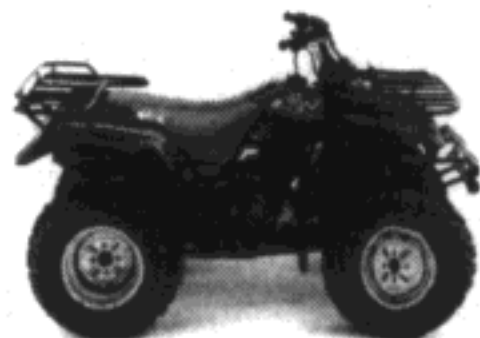
BIG BEAR 4x4

Yamaha offers four distinctly different 4X4 ATVs that can take you way beyond the beaten path. • The Wolverine, Kodiak, Timberwolf and Big Bear 4X4s all have powerful, reliable four-stroke engines, large front and rear cargo racks, electric starting, reverse gears, large comfortable seats and smooth long travel suspension. • They'll take you way out back - and bring you home again. •