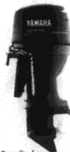
Four Stroke F50HP

ATVs with engine sizes of 90 cc or greater are recommended for use only by those age 16 and older. YAMAHA recommends that all ATV riders take an approved training course. For safety and training information, see your dealer or call the ATV Safety Institute at 1-800-447-4700. ATVs can be hazardous to operate. For your safety: Always wear a helmet, eye protection and protective clothing; never ride on paved surfaces or public roads; never carry passengers; never engage in stunt riding; riding and alcohol/drugs don't mix; avoid excessive speed; and be particularly careful on difficult terrain.