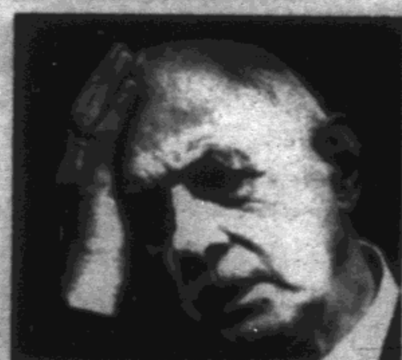
KENT BRANDLEY STATE REPRESENTATIVE

TODAYS problems demand NEW solutions NEW FACES