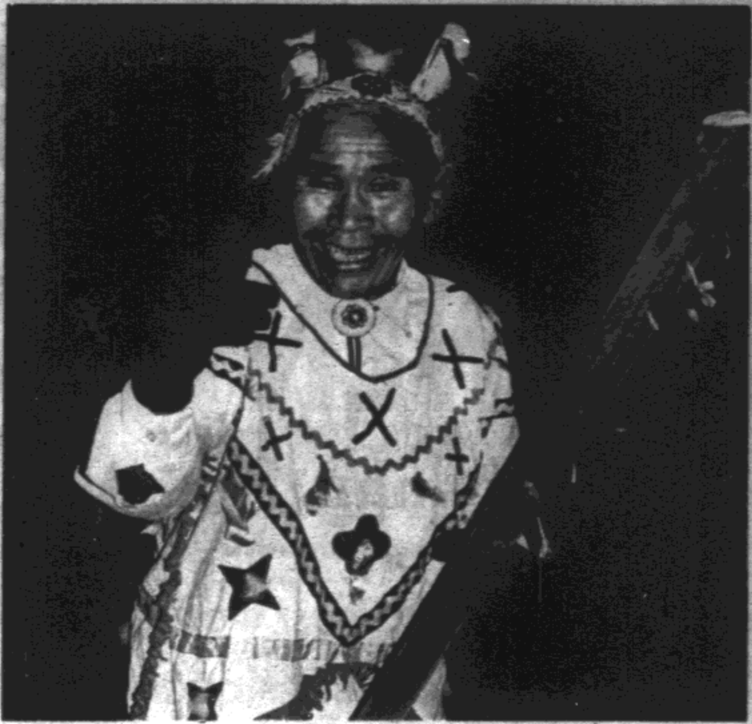
ATHABASCAN DANCER —Athabascan Indian from Pin to happily performs the dance of his people.