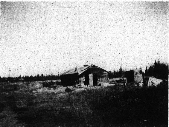
AGNES AND PAUL James are renting this house for $10 per month. They have no electricity. They are too far from the city pump house. This house is in no better condition than the house prior to moving into this one.