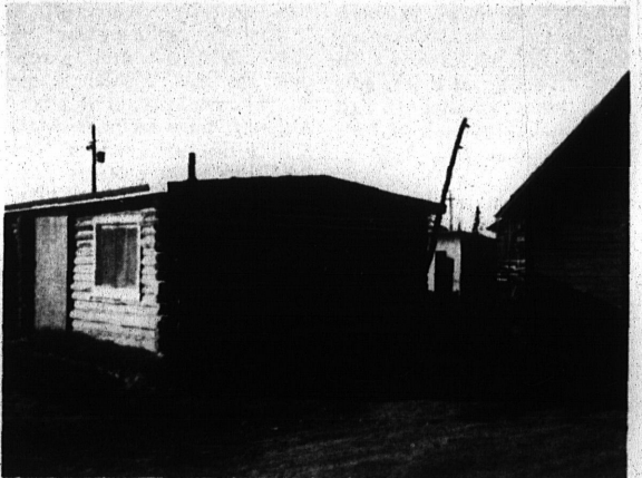
THIS HOUSE is a rental unit. Such houses are rented, too, because people just can't find any place better.