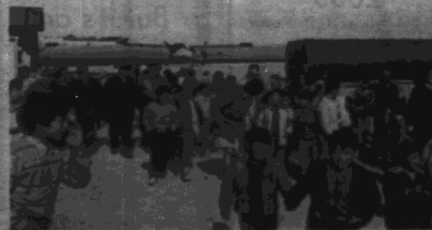
TELLER GREETING —After converging on the Governor's plane, Teller youngsters escort their guest to the village.