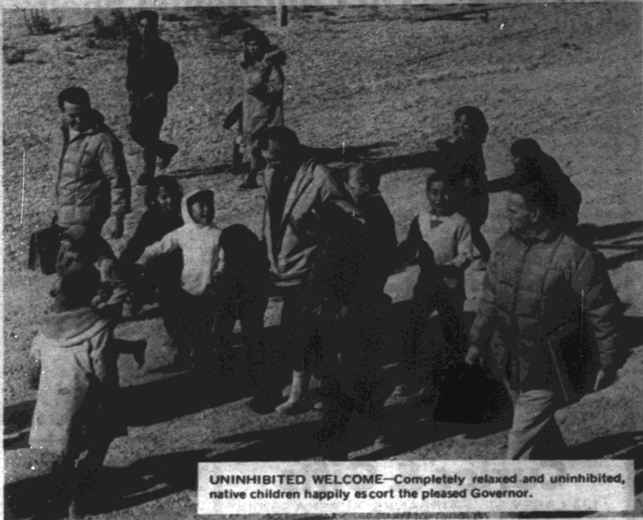
UNINHIBITED WELCOME —Completely relaxed and uninhibited, native children happily escort the pleased Governor.