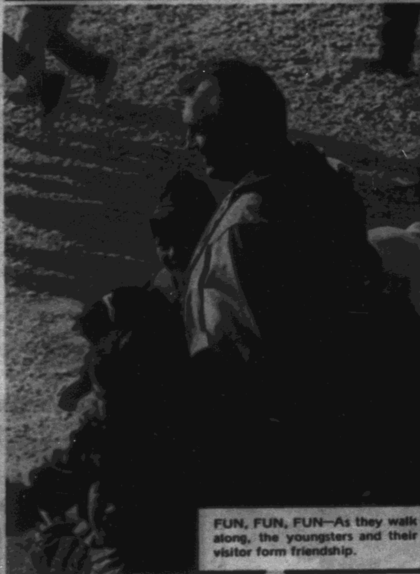
FUN, FUN, FUN —As they walk along, the youngsters and their visitor form friendship.