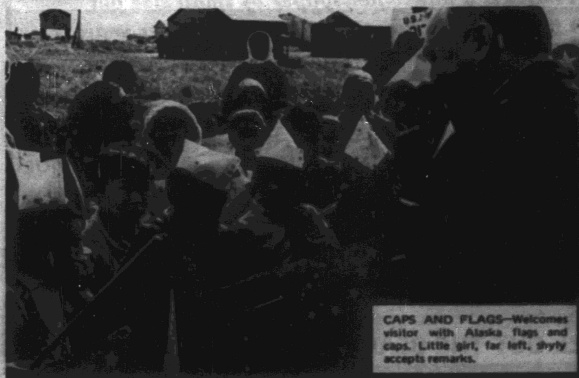
CAPS AND FLAGS —Welcomes visitor with Alaska flags and caps. Little girl, far left, shyly accepts remarks.