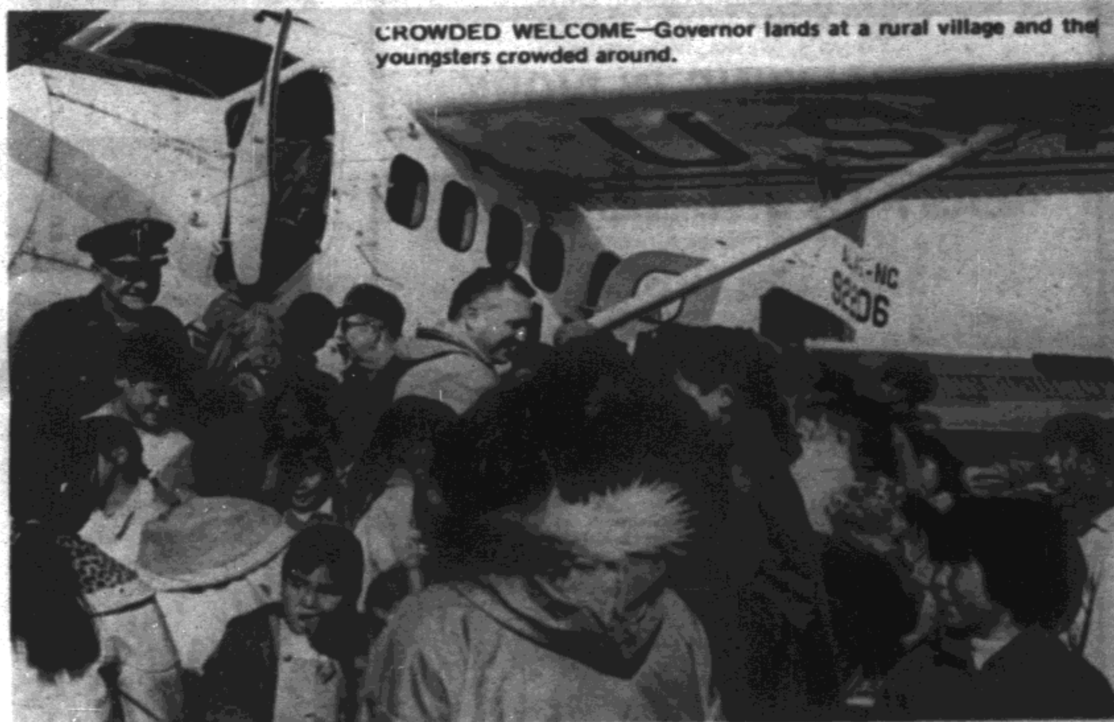
CROWDED WELCOME —Governor lands at a rural village and the youngsters crowded around.