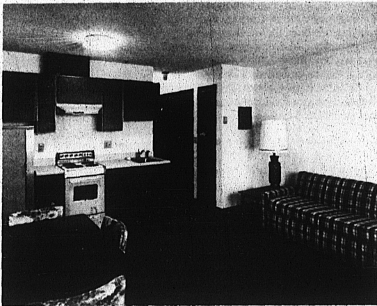
ATTRACTIVE UNIT — New Bethel apartment/hotel will soon be offering these attractive units and at an attractive price. The new facility belongs to the Bethel Native Corporation.