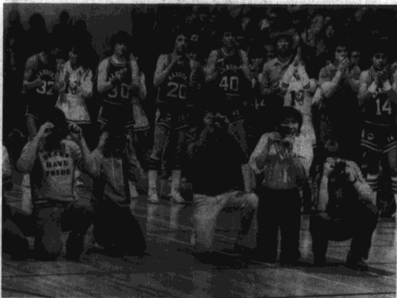
The Noorvik Bears may have lost the championship game, but that didn't stop proud fans from photographing them as they received their second place trophy.

ming races from one end of the basketball court to another, the Nanooks stood to applaud the Bears as they accepted their second place medals and posed for their happy fans.