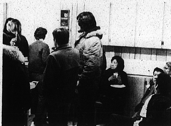
SOME of the one hundred people who attended the open house at the new clinic in Unalaska.