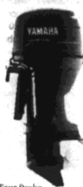
Four Stroke F50HP