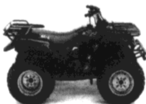
BIG BEAR 4x4

Yamaha offers four distinctly different 4X4 ATVs that can take you way beyond the beaten path. • The Wolverine, Kodiak, Timberwolf and Big Bear 4X4s all have powerful, reliable four-stroke engines, large front and rear cargo racks, electric starting, reverse gears, large comfortable seats and smooth long travel suspension. • They'll take you way out back - and bring you home again. •