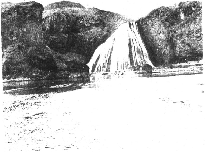
FAN OUT FALLS — The land of the Aleuts on the farflung Aleutian Chain offers some of the

world's most spectacular scenery. A beautiful water fall tumbles down in a fan out