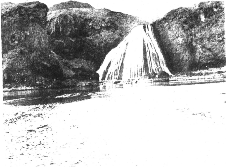
FAN OUT FALLS — The land of the Aleuts on the farflung Aleutian Chain offers some of the

world's most spectacular scenery. A beautiful water fall that tumbles down in a fan out.