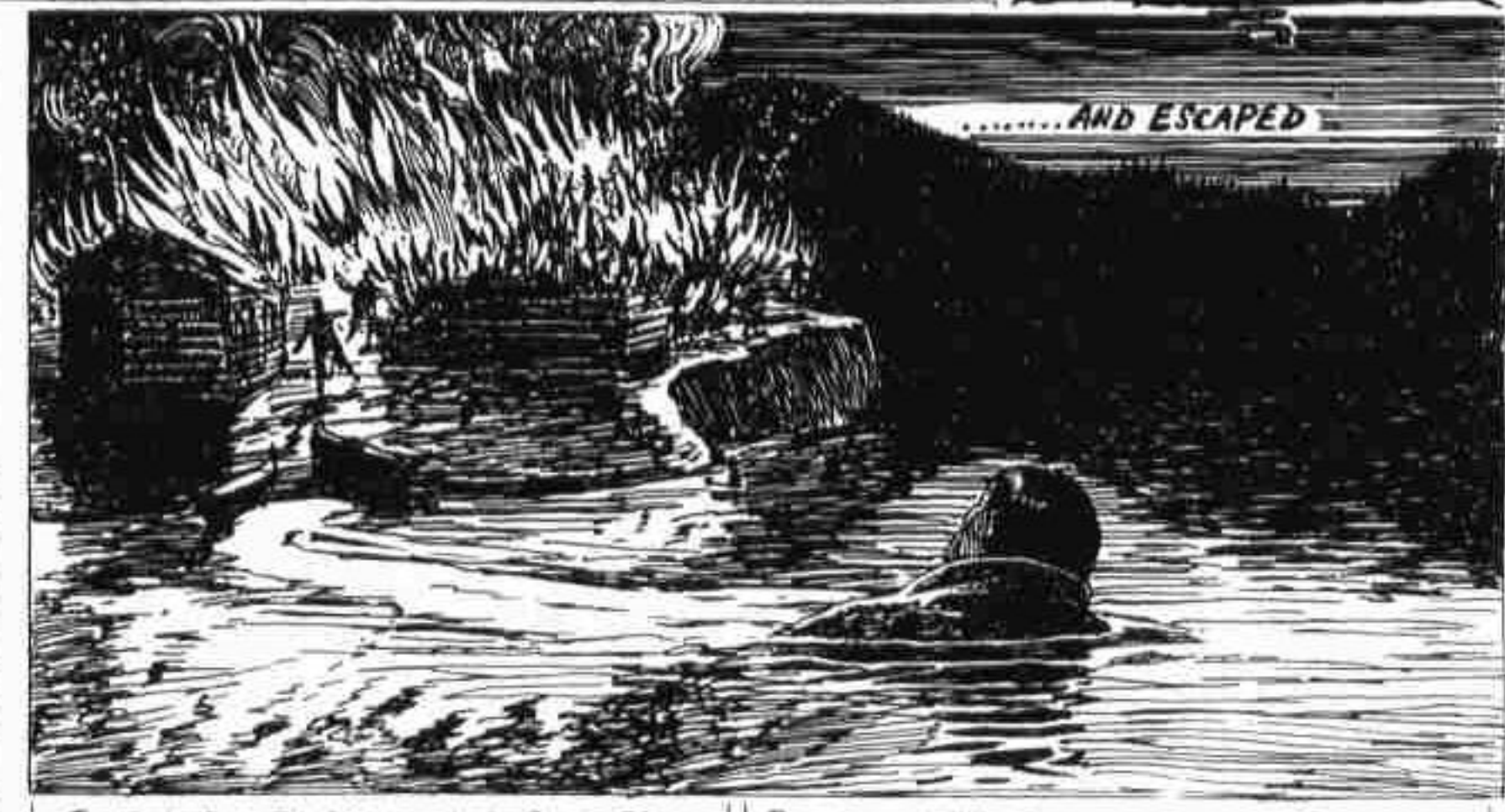
T FOUND A BAIDARKA AND PADDLED TO KODIAK

Even today we worry about whales, bald eagles, and other wild animals becoming extinct. On the other hand we never worry about chickens or cattle suffering the same fate. Why? the answer lies in the fact that people own chickens and cattle. They are not common property,