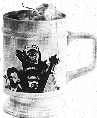
The official Top of the World Drink. Sourdough Coffee Royale for breakfast. And complimentary wine with lunch and dinner—for everyone on board who's old enough.

Ask your travel agent to put you on Top of the World.