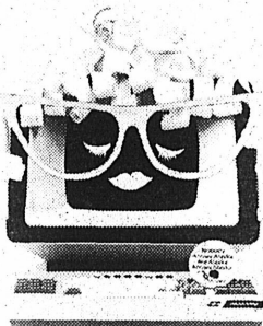
Alice is Tops. Nobody knows more about reservations than Alice, our IBM-360 computer and super reservations gal. Call and find out.