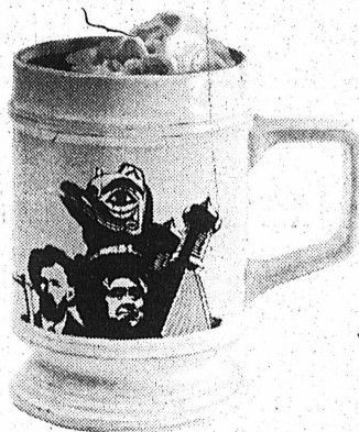
The official Top of the World Drink. Sourdough Coffee Royale for breakfast. And complimentary wine with lunch and dinner—for everyone on board who's old enough.

Ask your travel agent to put you on Top of the World.