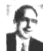
Sheffield surgery successful