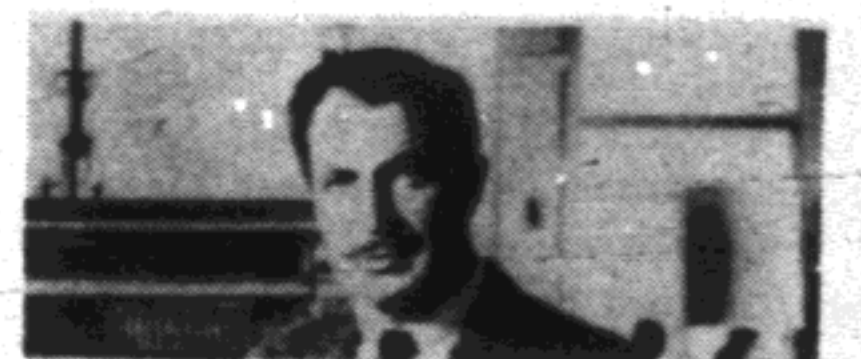
Introduction by Vincent Price