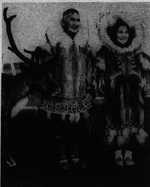
A PRIME ITEM FOR GIVING ANYTIME

"Be happy. I know this way how I be "Longest Reindeer Herder." Start 1908, finish 1954, altogether 46 years herd reindeer."