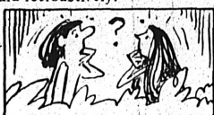
The Melanesians believe that the first man was made from the rib of the first woman!

The undersecretary further stated that all AFDC and SSI payments previously withheld from Alaskan Natives will be paid retroactively.