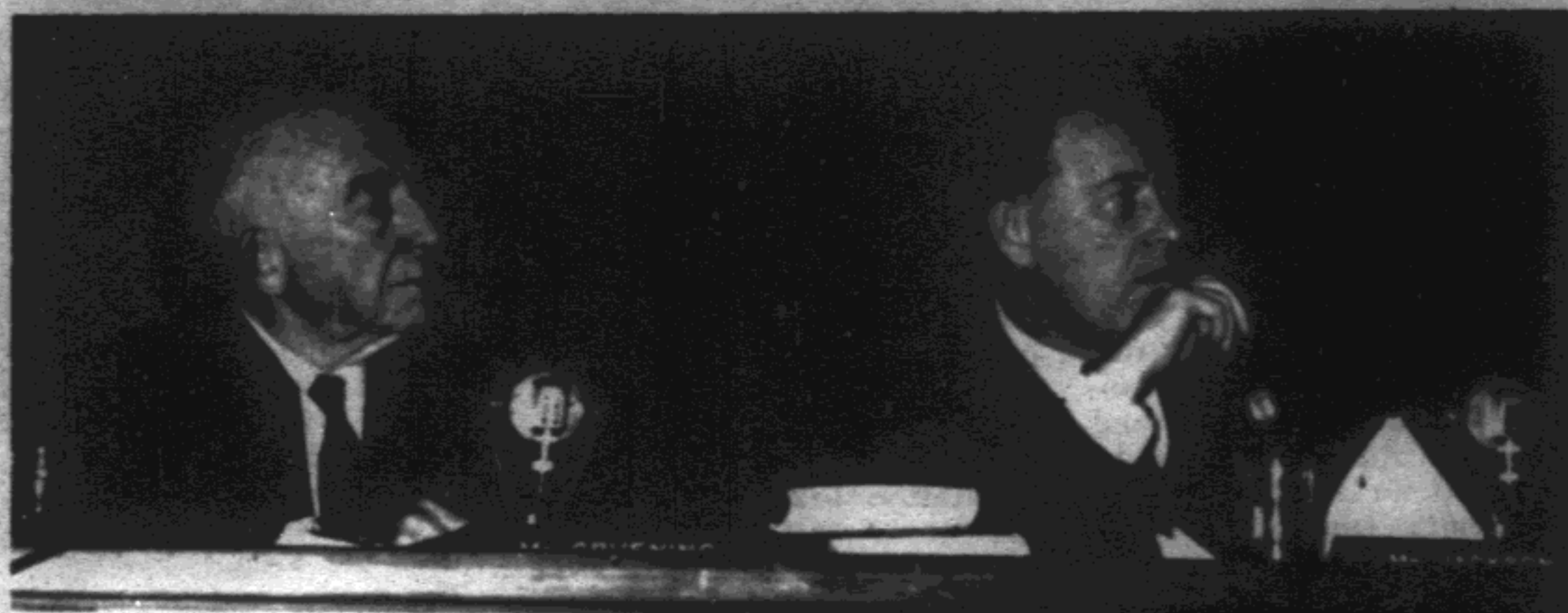
LISTENING TO TESTIMONY —Senators Ernest Gruening and Henry Jackson are intently listening to testimony at the land claims hearings in Anchorage last week. Senator Jackson, right, is the chairman of the Senate Committee on Interior and Insular Affairs under which he and Senator Lee Metcalf conducted the hearings.