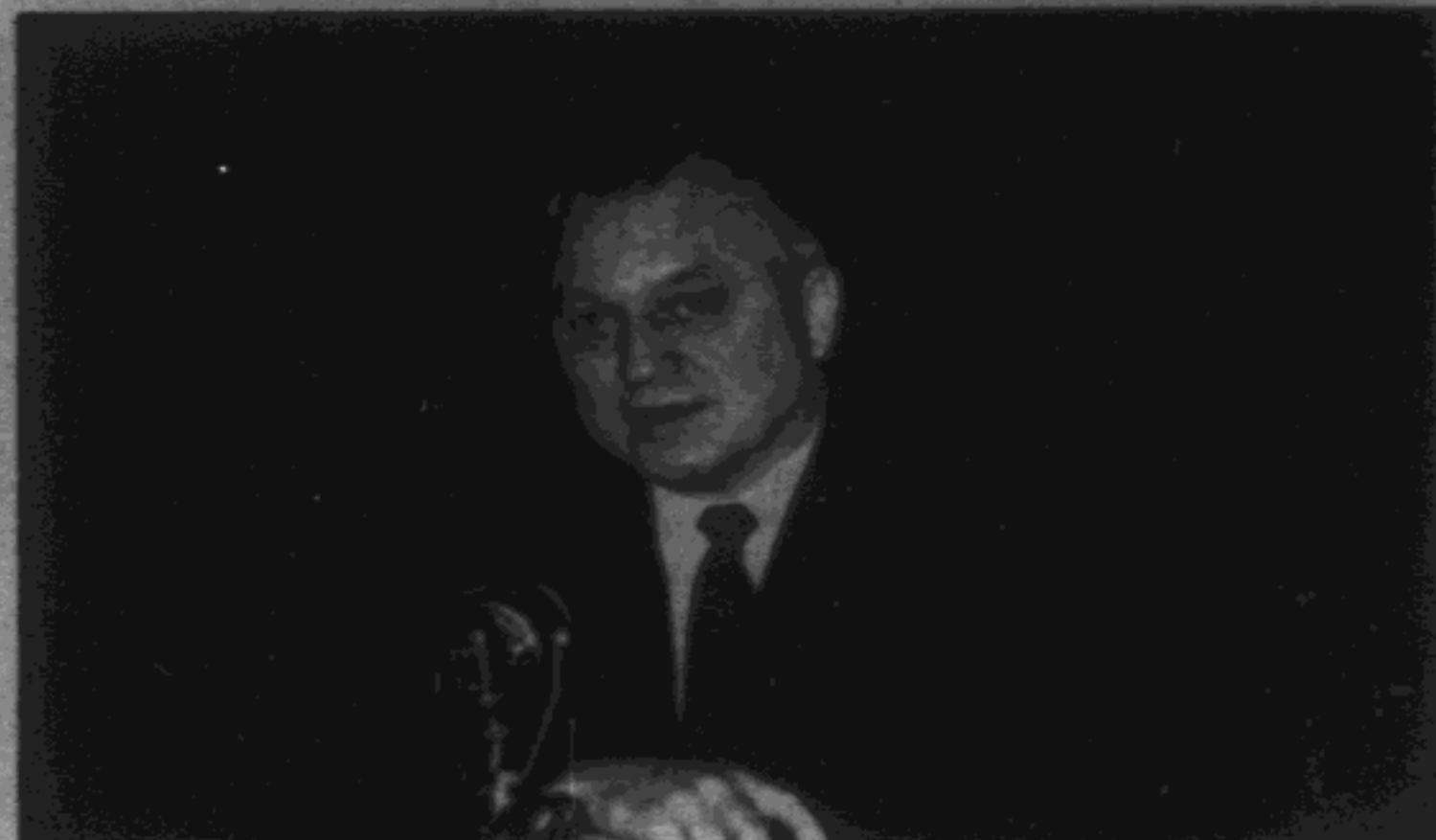
GOV. WALTER J. HICKEL —State Chief Executive is testifying before the Senate Committee on Interior and Insular Affairs at the land claims hearing in Anchorage. Hickel declared in part, "...A generous grant of title to lands on which native communities may prosper and grow, and develop their economic resources for the good of all Alaskans, and, indeed, of all Americans; and, a fair monetary settlement of claims to lands which are irretrievably gone..."