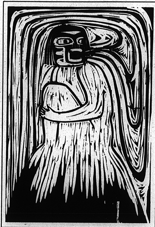
Raven Made the North Wind

A COLLECTION OF WOODCUTS by Dale De Armond