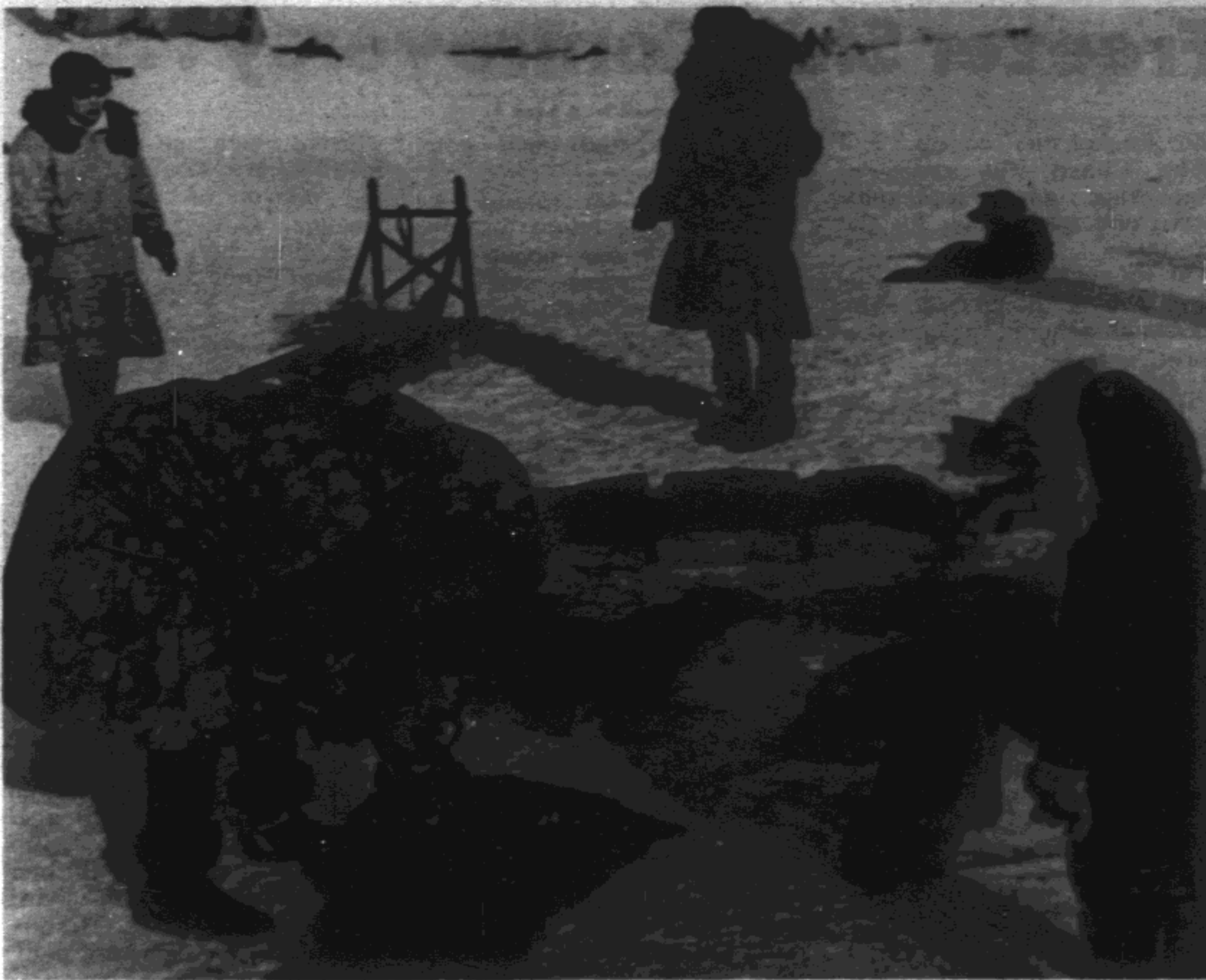
APPORTIONING BELUGA—Although the spring Pt. Hope whalers main quarry is the bowhead, they also hunt the beluga whale. Here the women are apportioning a beluga