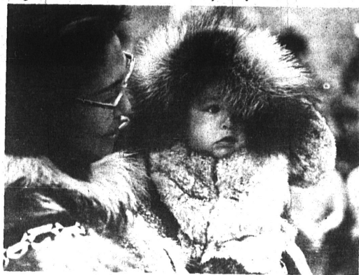
NATIVE BABY CONTEST — will be held at the World Eskimo Indian Olympics, July 26, 27, and 28. Villages and individuals are asked to enter babies of at least one-quarter native blood, dressed in authentic costumes.