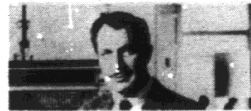
Introduction by Vincent Price