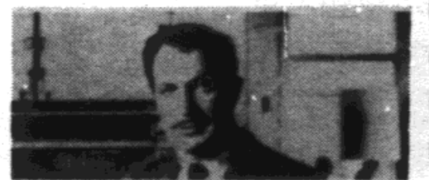
Introduction by Vincent Price