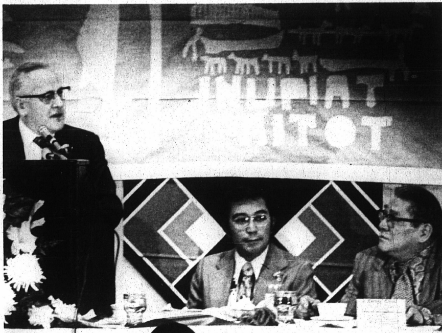
MAJOR POLICY SPEECH —Governor William A. Egan surprised and deeply moved the audience by delivering a major policy speech at the banquet. Listening attentively to the speech are,