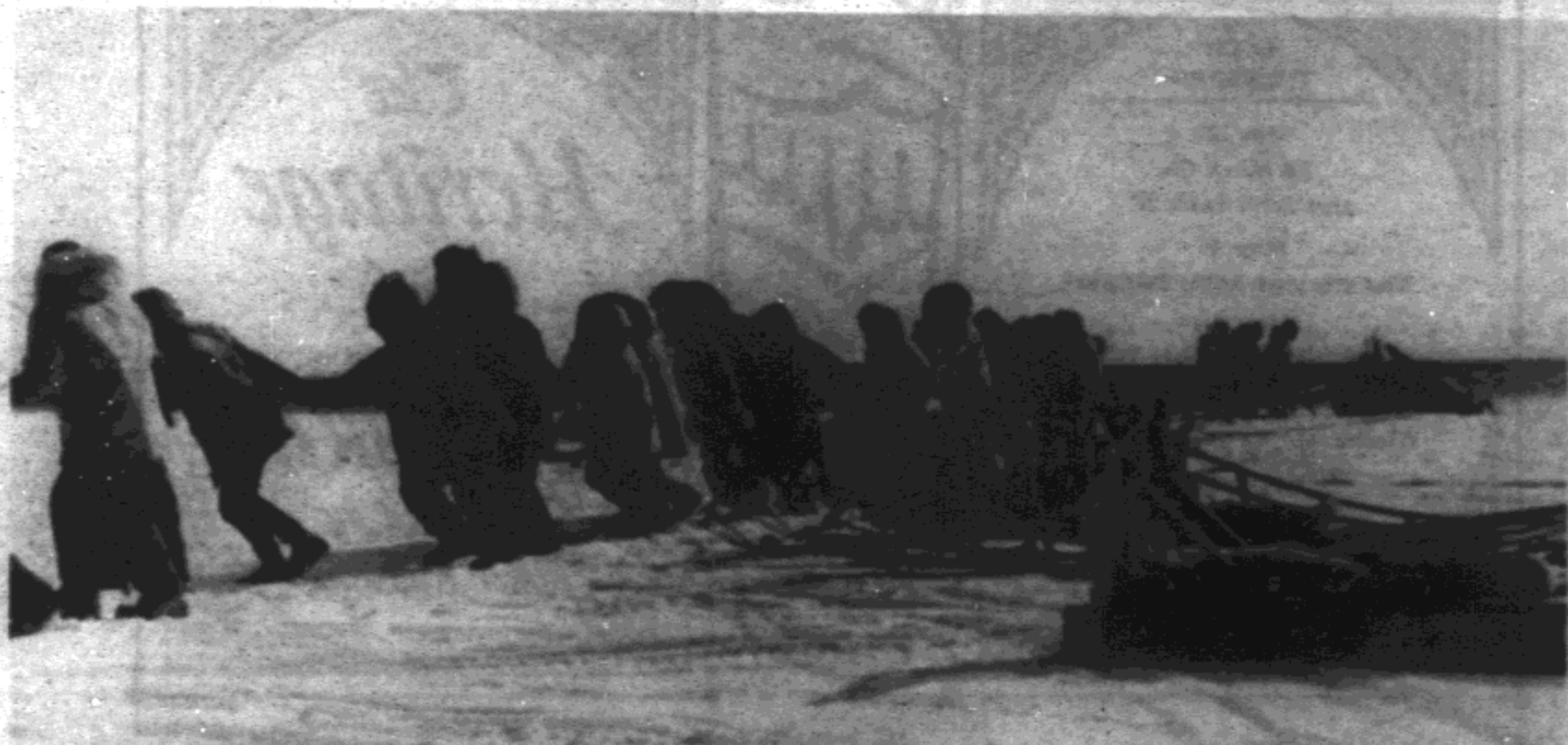
OUT OF THE SEA —The tightening of the ropes of the block and tackle begins to bring the whale out of the water. Note

movie maker at far right, snow machine and sleds.