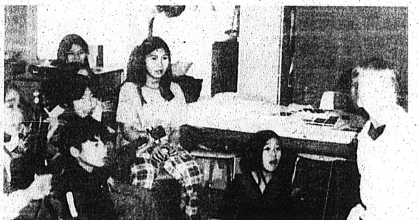
WHAT IS THIS? — What's that chord, ukes?