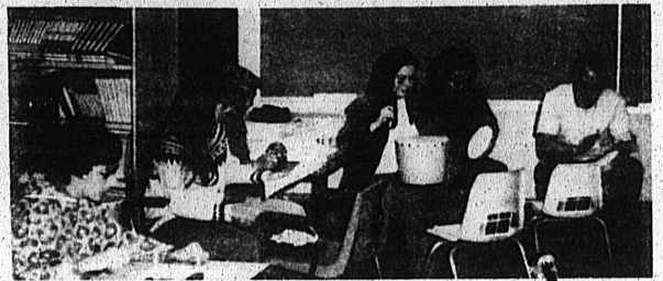
INSTRUMENTS — Teachers are getting familiar with the instruments they have to use while teaching children in the music program on the North Slope.