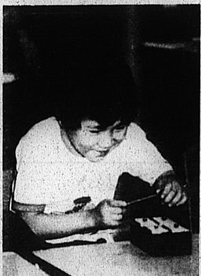
GETTING ON TO IT — This is a cinch.