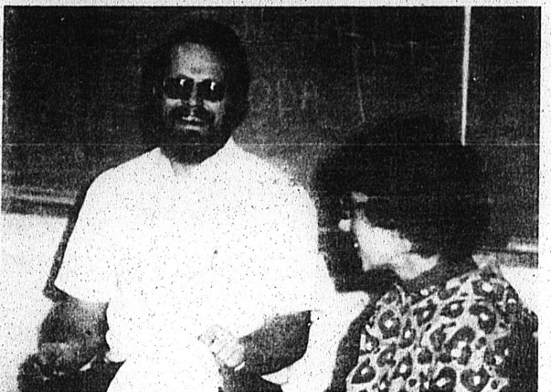
SOMEONE SLIPS A BEAT — Amused instructor of the teachers said, "That was a march — you played a waltz."