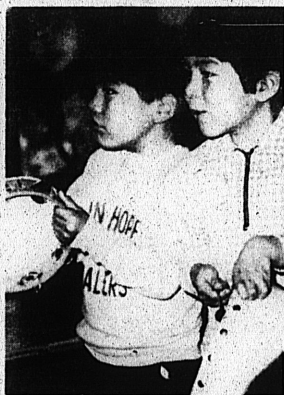
BOOM, BOOM, BOOM, — We're the percussion section.