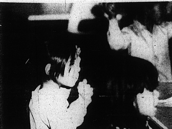
READY, CHILDREN — Snap on three.