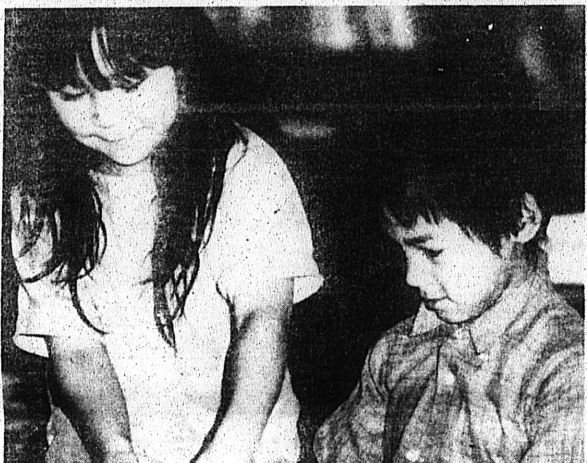
IT'S DONE THIS WAY — Children teach each other.