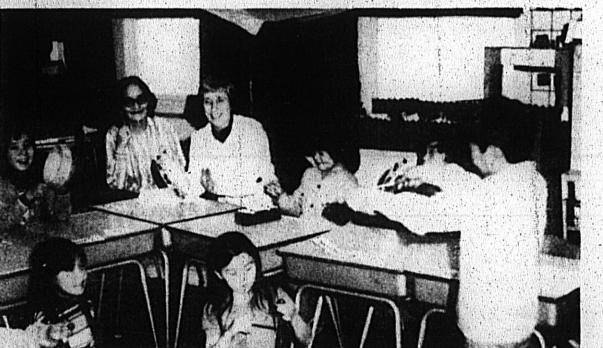
PAY ATTENTION — Watch the director, now.