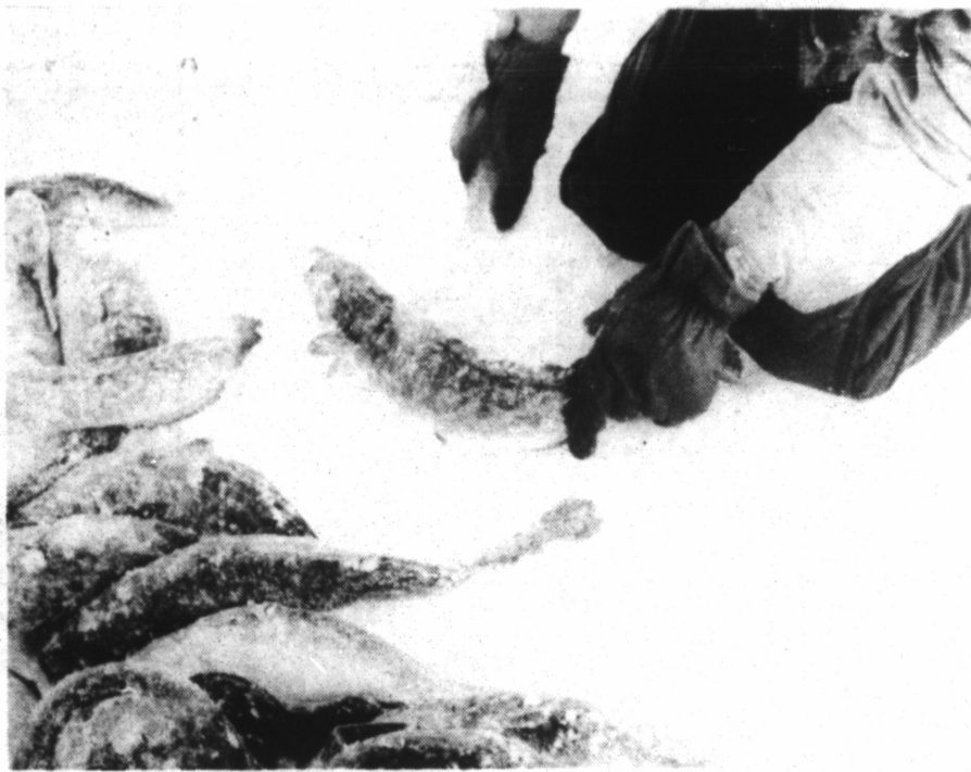
A quick blow finishes off the fish.