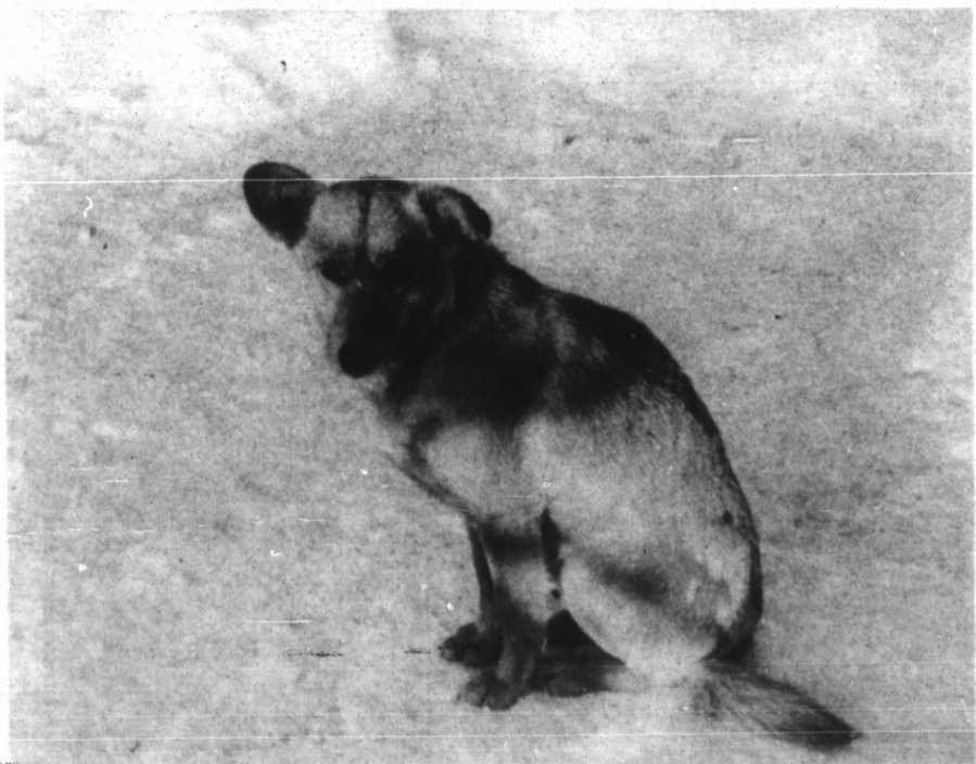
The dog watches the action.