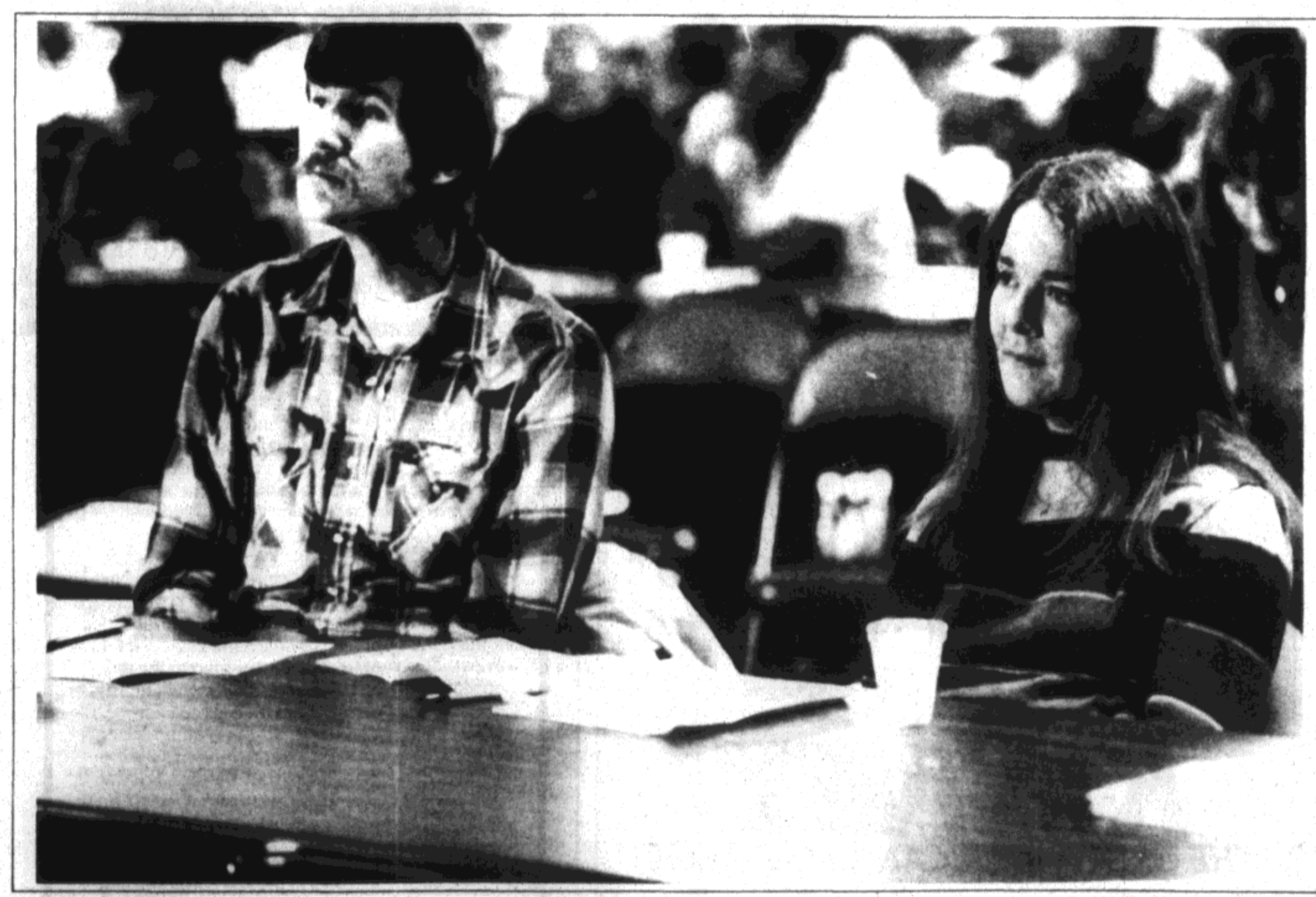
Copper River school teachers at in-service.

"We as parents really need encouragement," she said. She cautioned teachers to acknowledge important cultural differences, and cited an incident in which her son killed his first