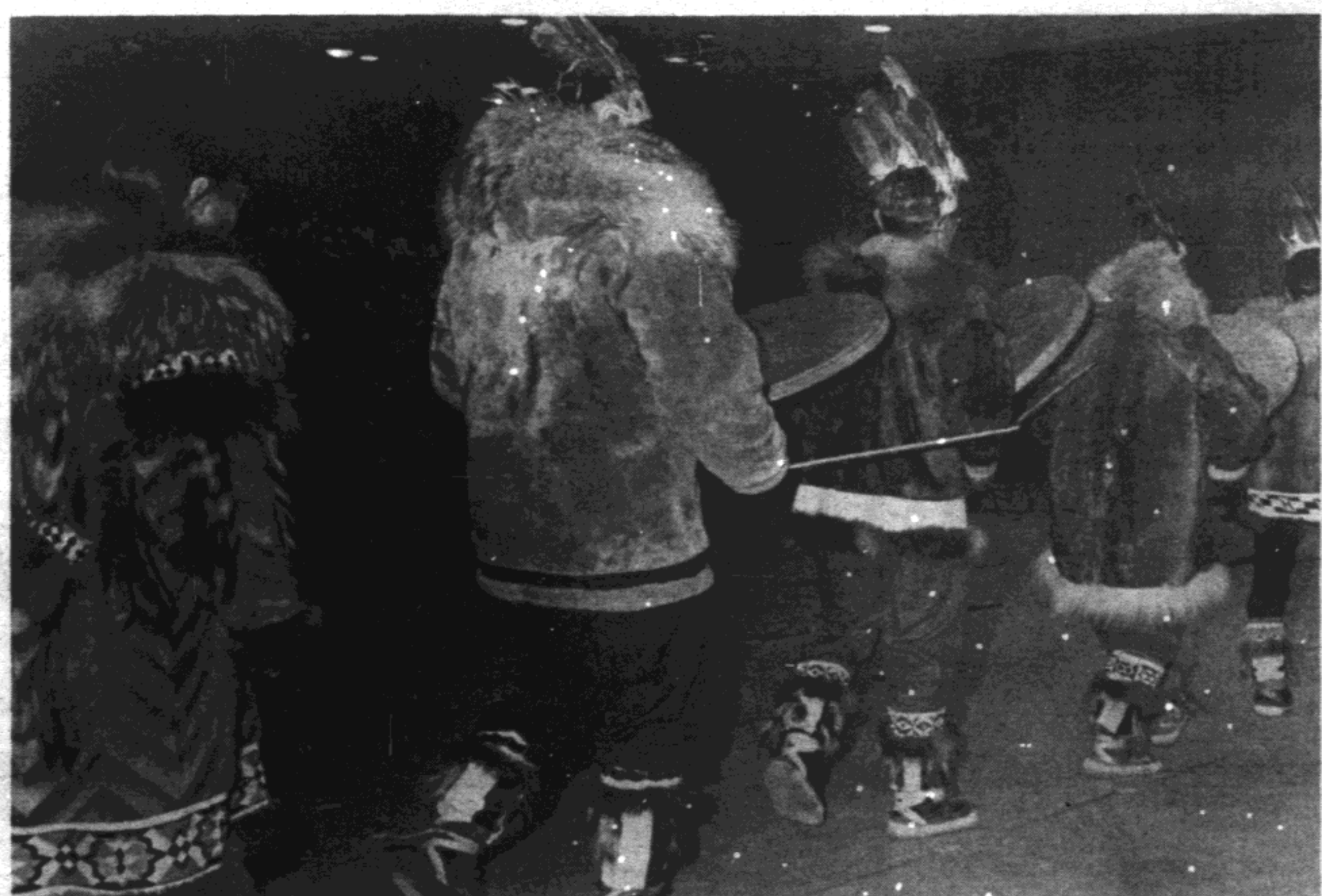
BARROW DANCERS—Winning Barrow Eskimo dancers are seen leading the parade of Olympics performers prior to performance of events. They