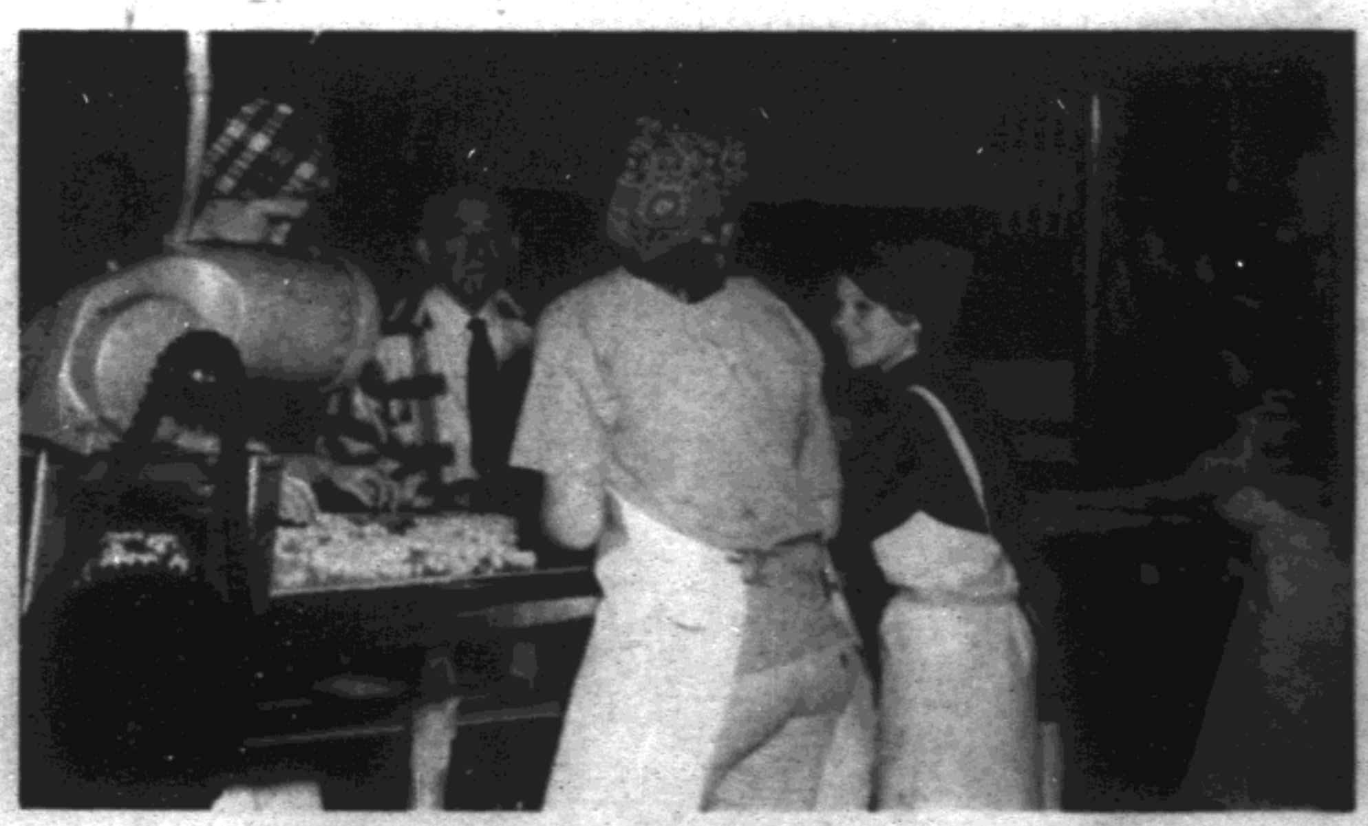
Shrimp cannery workers at Kodiak meet the Senator,

Senator Gruening has a dream for Alaska. He is hard at work to make the dream come true.