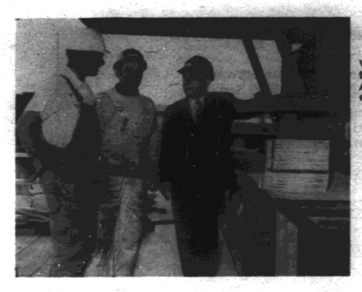
Visiting the Anchorage Airport terminal extension project.