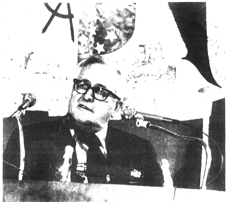
KEYNOTE SPEAKER —Alaska Governor William A. Egan delivered the opening remarks on the first day of the AFN Convention on Dec. 20. Egan said that he was proud to be in Anchorage and that he was proud to be in Alaska.