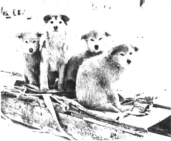
A FUTURE DOG TEAM tries riding on the sled (above) while their rival, the snow machine, gets a brush off from an Anaktuvuk housewife.