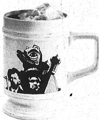
The official Top of the World Drink. Sourdough Coffee Royale for breakfast. And complimentary wine with lunch and dinner—for everyone on board who's old enough.

Ask your travel agent to put you on Top of the World.