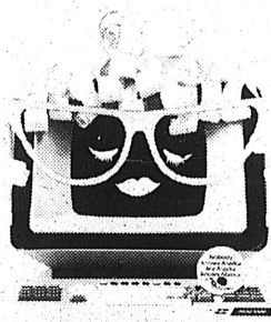
Alice is Tops. Nobody knows more about reservations than Alice, our IBM-360 computer and super reservations gal. Call and find out.