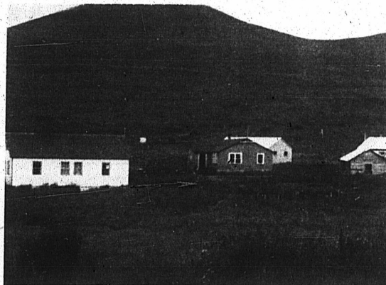
THE VILLAGE of Akhiok on the southern tip of Kodiak Island.